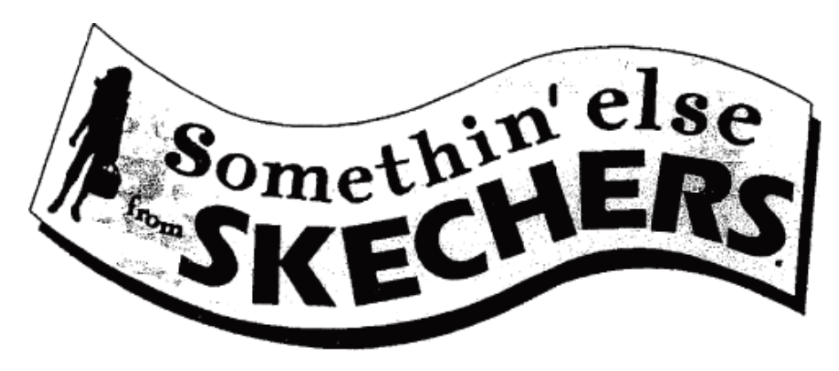
Page 1 of 5

DocketGoodsSerial No.Registration No.Decl. ofMarkNo.ClassFiling DateUse DueStatus